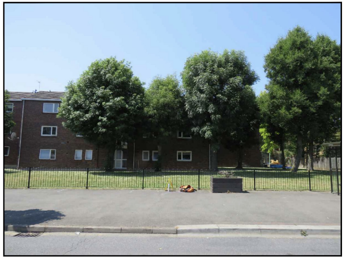
Position of proposed mast outside people's homes